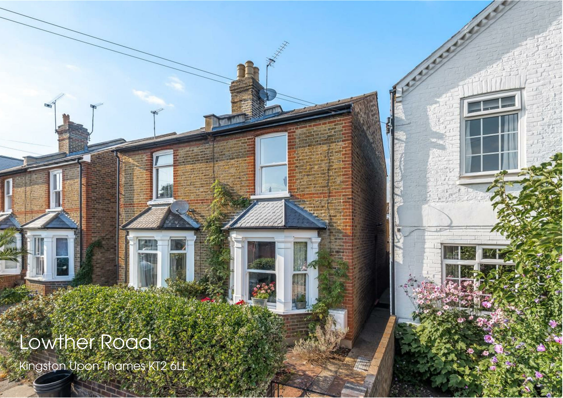
Lowther Road Kingston Upon Thames KT2 6LL